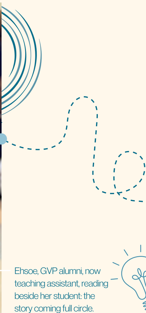
Ehsoe, GVP alumni, now teaching assistant, reading beside her student: the story coming full circle.